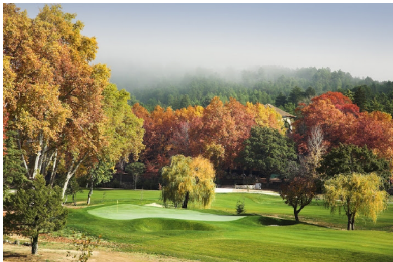
The Vidago Palace Hotel Golf Course is the ideal place for anyone wanting to combine golf with relaxation and tranquility.

We will meet tonight for an included group dinner at the hotel. Enjoy your day in the lovely palace hotel. I think you might feel a bit like royalty.