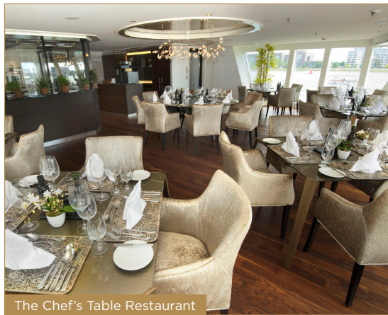
The Chef's Table Restaurant

AmaWaterways' twin-balcony ships represent some of the newest vessels in our fleet. Heated pools with a swim-up bar provide a tranquil environment for viewing stunning mountains and spired skylines. Plus, spacious staterooms afford guests comfort and privacy to rejuvenate while still experiencing the magnificent scenery.